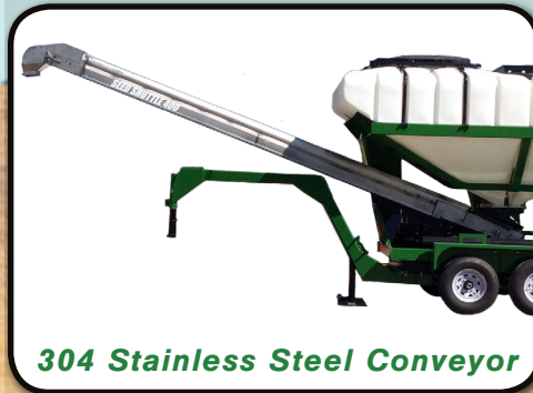
304 Stainless Steel Conveyor